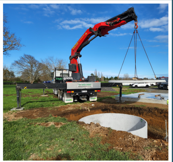
Putting the lid on the tank