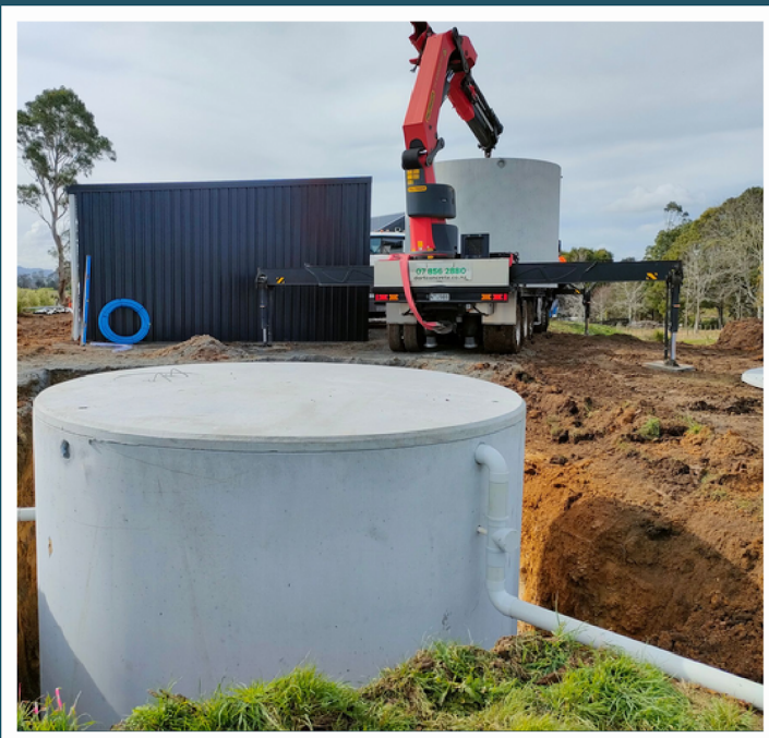
Example semi buried install