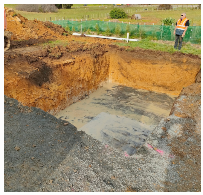
Preparing site for the tanks